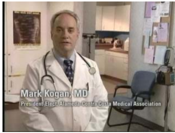
Like any doctor, I do everything in my power to convince people to stop smoking.