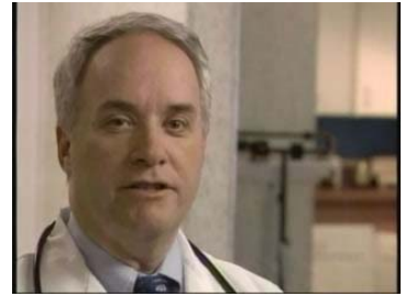
But that's not what Prop 86 is all about. Prop 86 raises billions in taxes,