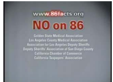
[Announcer]: Read for yourself, Prop 86 is not what it claims.