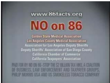
That's why doctors, police, business, and taxpayer protection groups oppose Prop 86.