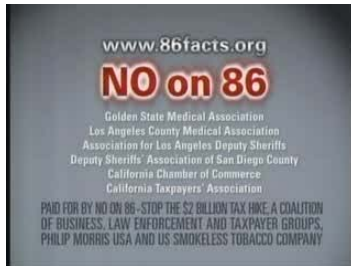
[PFB]: No on Proposition 86