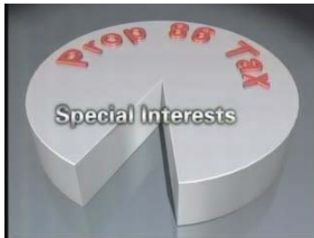
The rest of the money goes to the special interests sponsoring the measure and to more government bureaucracy."